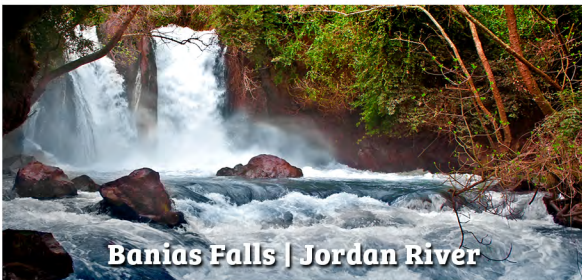
Banias Falls | Jordan River