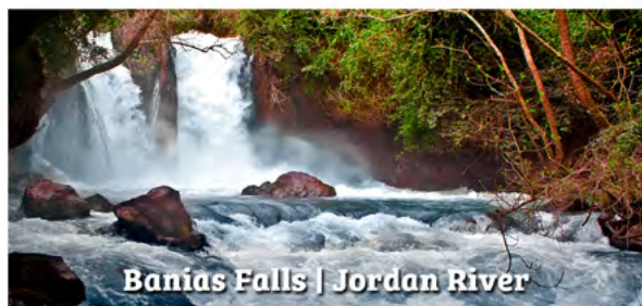
Banias Falls | Jordan River